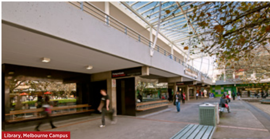
Library, Melbourne Campus