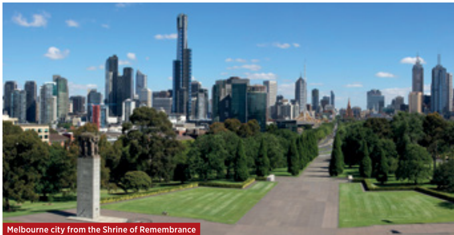
Melbourne city from the Shrine of Remembrance

Melbourne was ranked the fourth most student-friendly city in the world*. It has also been consistently ranked as one of the world's top three most liveable cities for many years†.