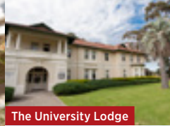
The University Lodge