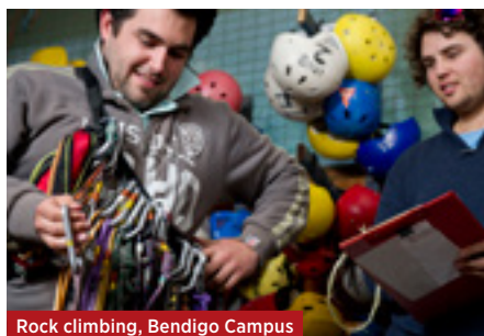
Rock climbing, Bendigo Campus

The biggest organisation is La Trobe's International Students' Association (ISA), which coordinates events and activities, has its own student lounge and liaises with La Trobe International and the Bendigo International Students' Club.