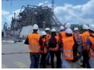
Vinci Construction : visite Musée de la Confluence 15 mai 2012

The Department of Civil Engineering and Urban Planning provides education in the scientific and technical fields of civil engineering and urban planning: